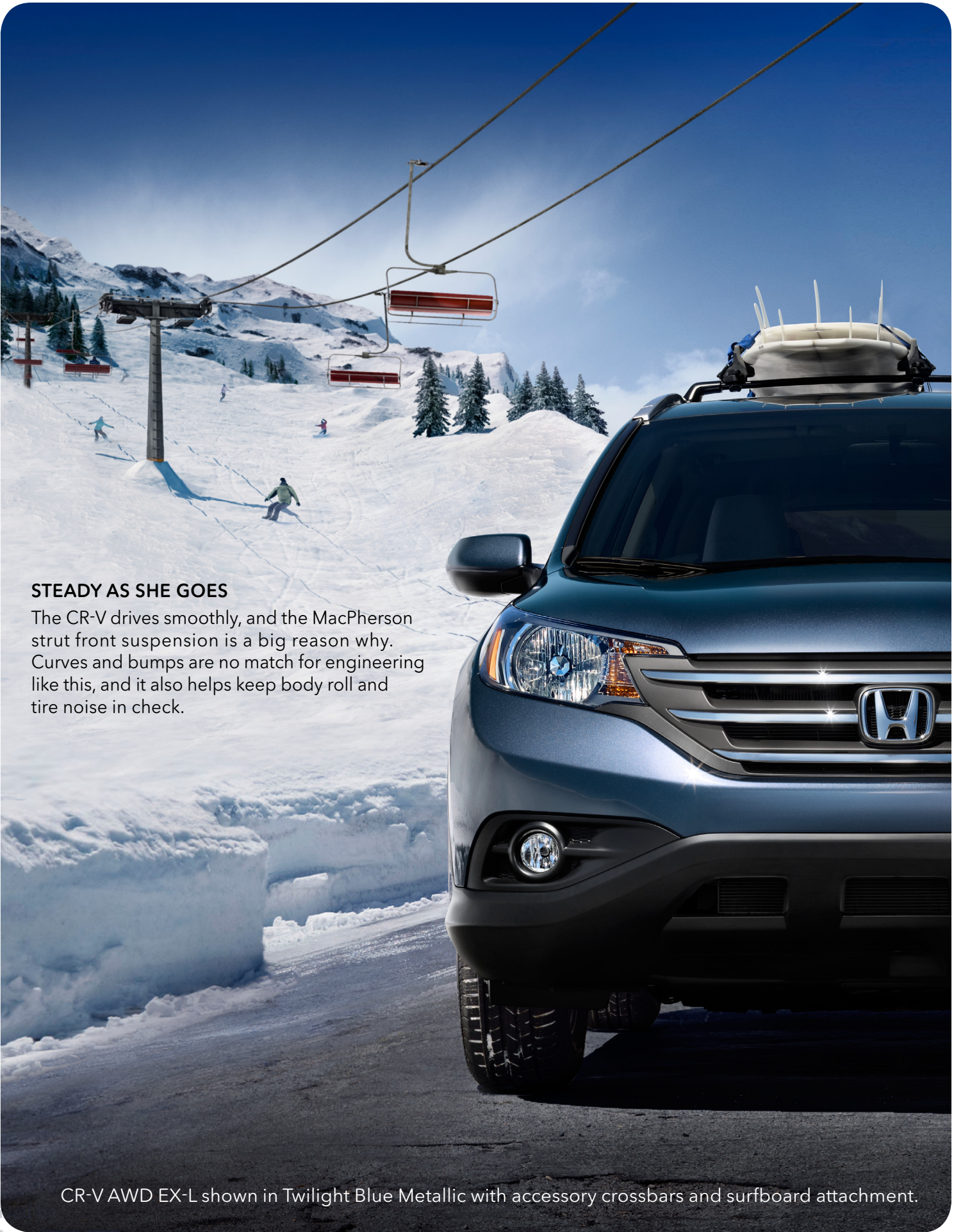
CR-V AWD EX-L shown in Twilight Blue Metallic with accessory crossbars and snowboard attachment.

The available Real Time AWD with Intelligent Control System™ helps your CR-V react lightning-fast to the slightest loss of traction. When the system senses wheel slippage, it electronically transfers power and hill start assist prevents the CR-V from rolling forward or backward when stopped on a steep grade.