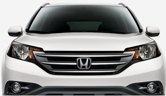
WHITE DIAMOND PEARL