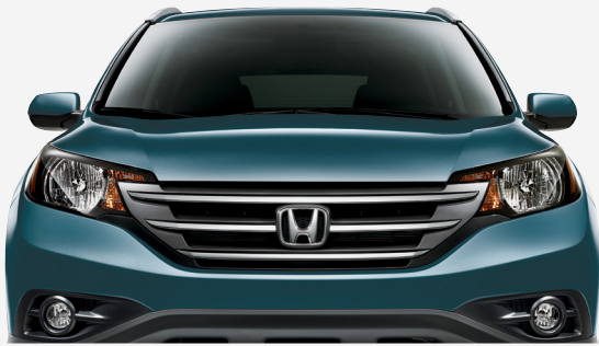
MOUNTAIN AIR METALLIC