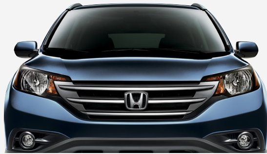
TWILIGHT BLUE METALLIC