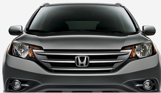
POLISHED METAL METALLIC