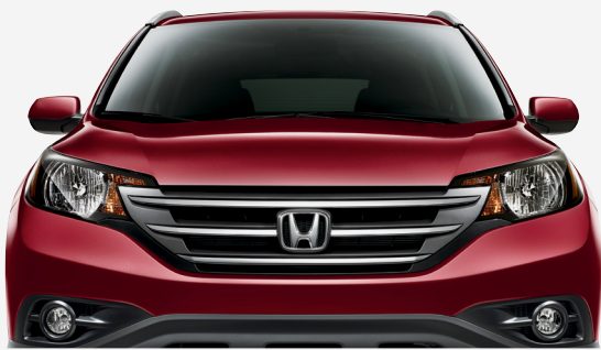
BASQUE RED PEARL II