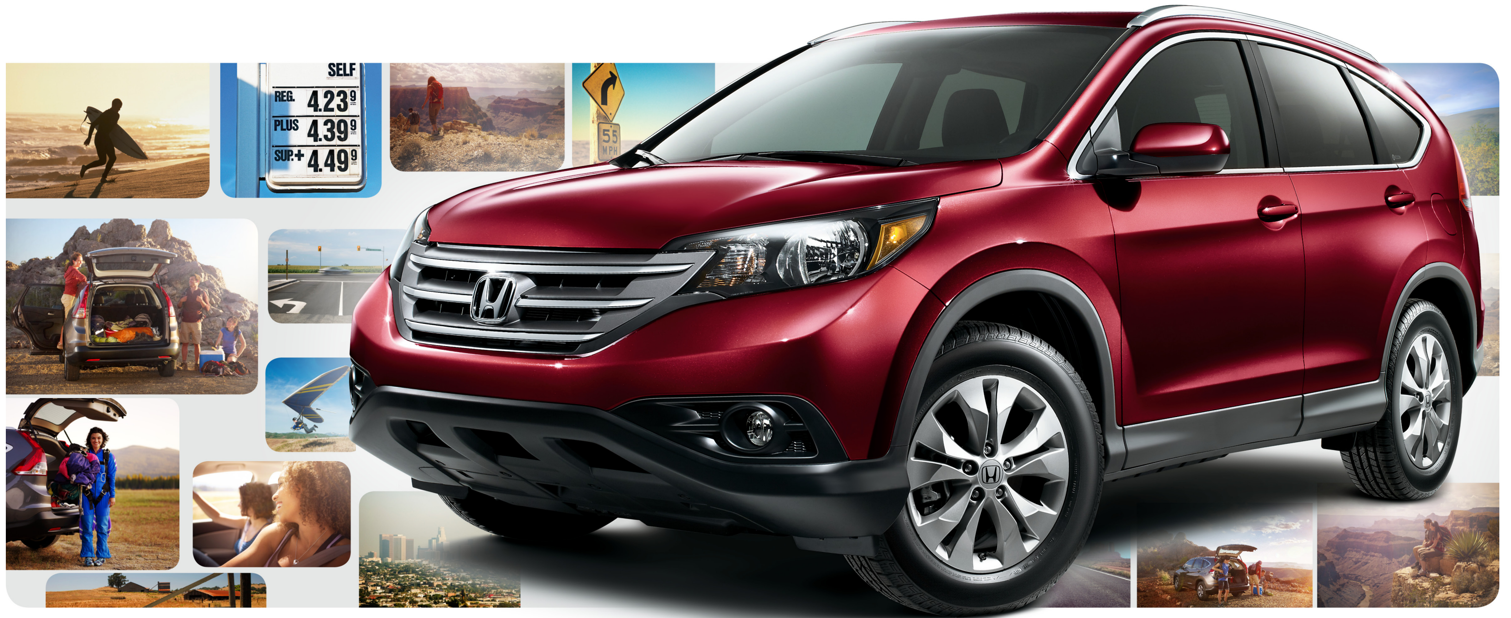
CR-V AWD EX-L shown in Basque Red Pearl II.

From bumper to bumper, the CR-V is loaded with just about everything you need to do all the things you want to do. It's your ultra-versatile adventure partner, built to take you just about anywhere you're willing to go. So buckle up and let's do this. We've got a lot of ground to cover.