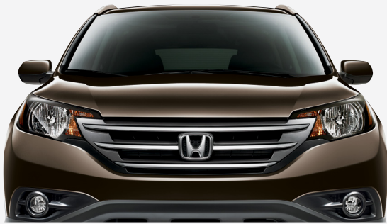
KONA COFFEE METALLIC